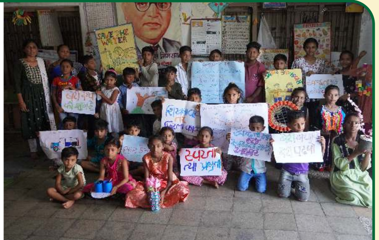
Summer Camp - Slums to Smiles