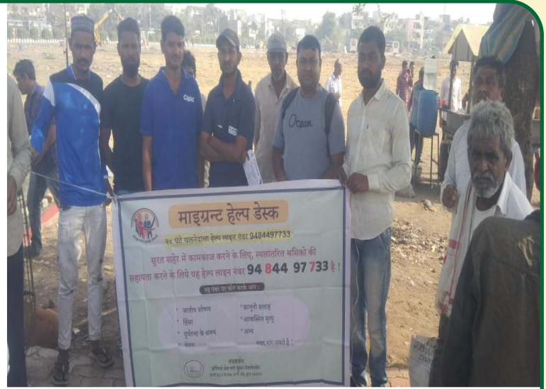
Migrant People – Protection and Guidance