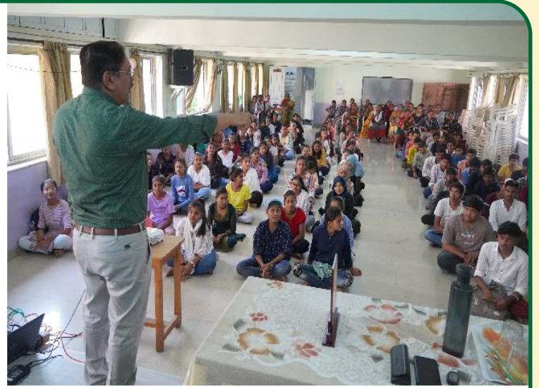
Career Guidance Camp