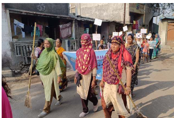
Awareness Campaign – Regarding Water Conservation and Sanitation