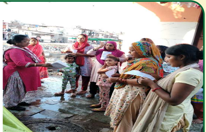
Spreading awareness among people about document proof