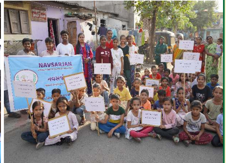
Children creating awareness about Voting